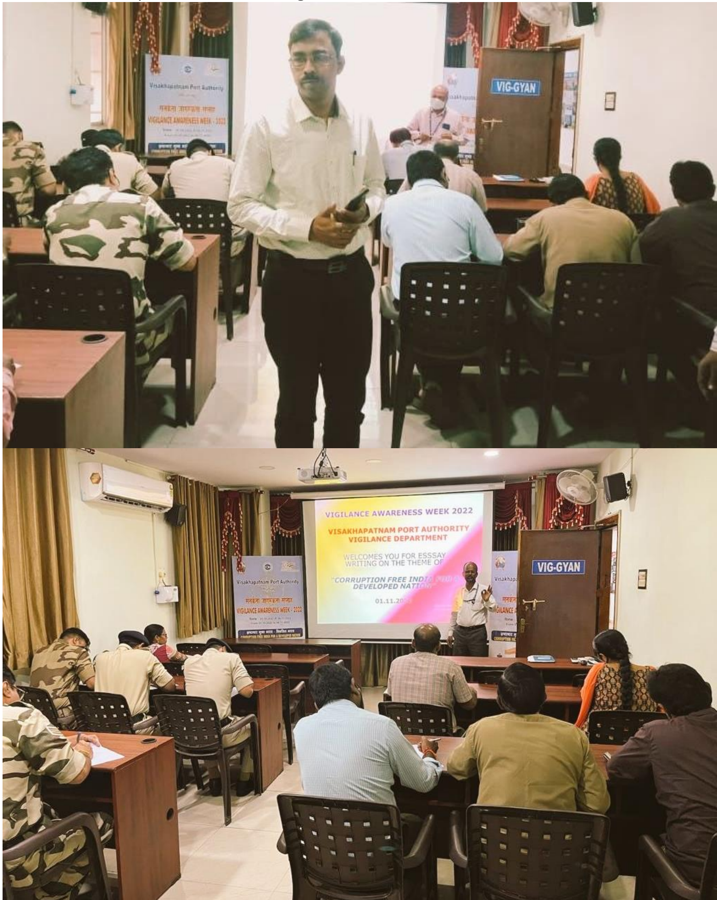
Essay Writing Competition on the theme of 'Corruption-free India for a developed nation'

In connection with Vigilance Awareness Week-2022, the Visakhapatnam Port Authority vigilance wing has conducted Essay Writing Competition on the theme of 'Corruption-free India for a developed nation' at the Vigilance conference hall on 01-11-2022.